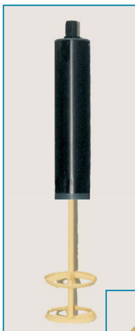
Faired Acoustic Sensor